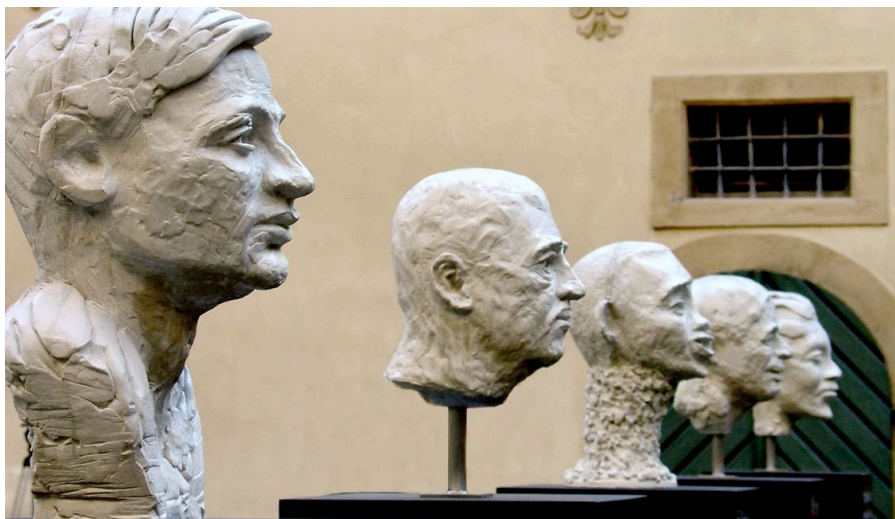
Missing Monuments, installation views, Landhaushof, Graz, 2007/08.