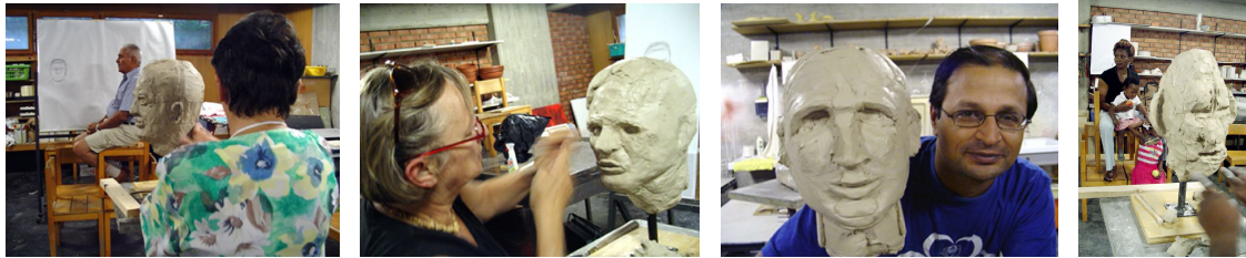
Missing Monuments, sculpture workshop.

The distinguished individuals were selected by their communities through a workshop involving volunteers from several communities. In the workshop, five biographical texts explaining accomplishments of the individuals honored by sculptural portraits were written. Within the workshop biographical texts of other people with migrant backgrounds were written as well. In addition, several texts were created based on interviews. There are 21 biographical texts created during the project, and they are made public through the web site missingmonuments.eu .