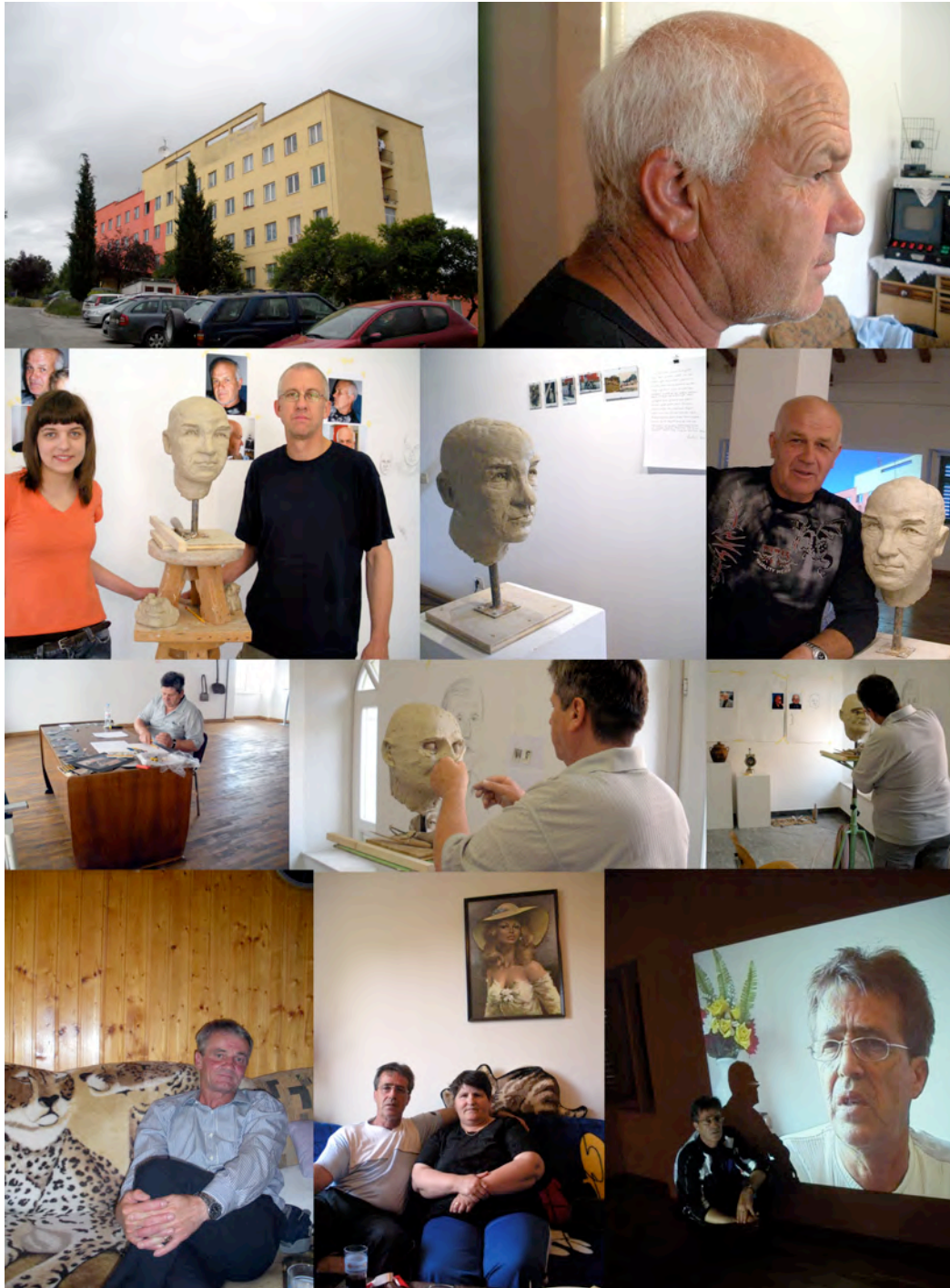
Miners' Memories, photo documentation of the working in the community, modelling workshop and video shootings, 2008.