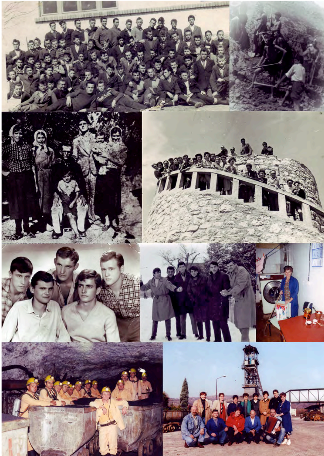
Miners' Memories, a selection of photographs from the community media archives created through the project, 2008.