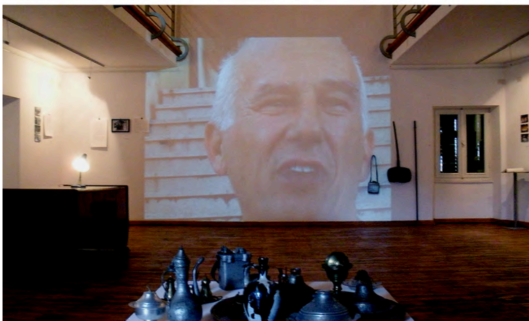
Miners' Memories, expanded documentary cinema, exhibition views, video documentary about the closing down of the mines, 40 min., Labin Municipal Gallery, 2008.