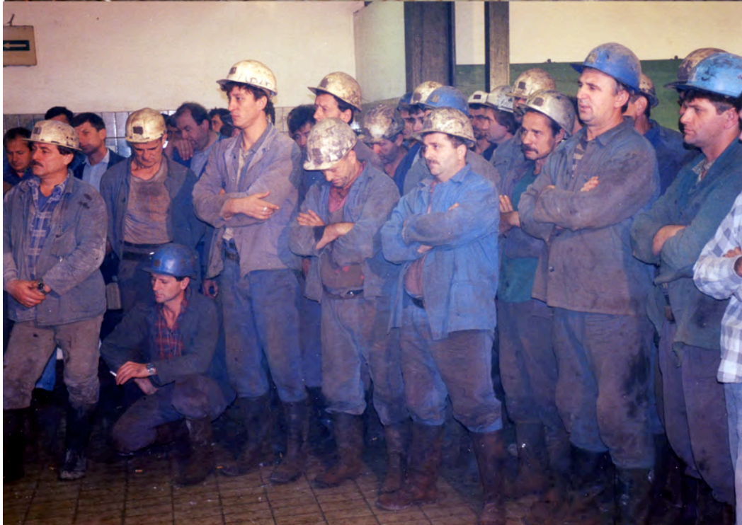
Miners' Memories, community project, 2008., photographs from the media archives created through the project.