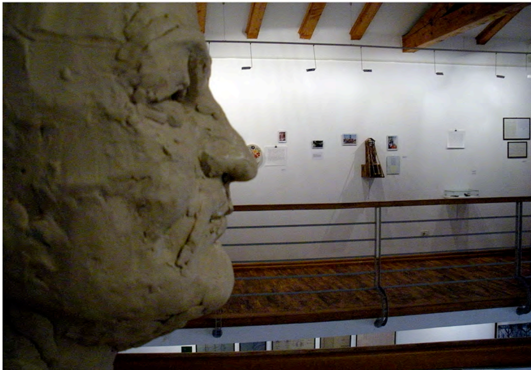
Miners' Memories, expanded documentary cinema, exhibition views, personal objects, photographs and documents of mine workers and their family members accompanied with handwritten statements, two portraits modeled within the project workshop by a student and an ex-mine worker, Labin Municipal Gallery, 2008.