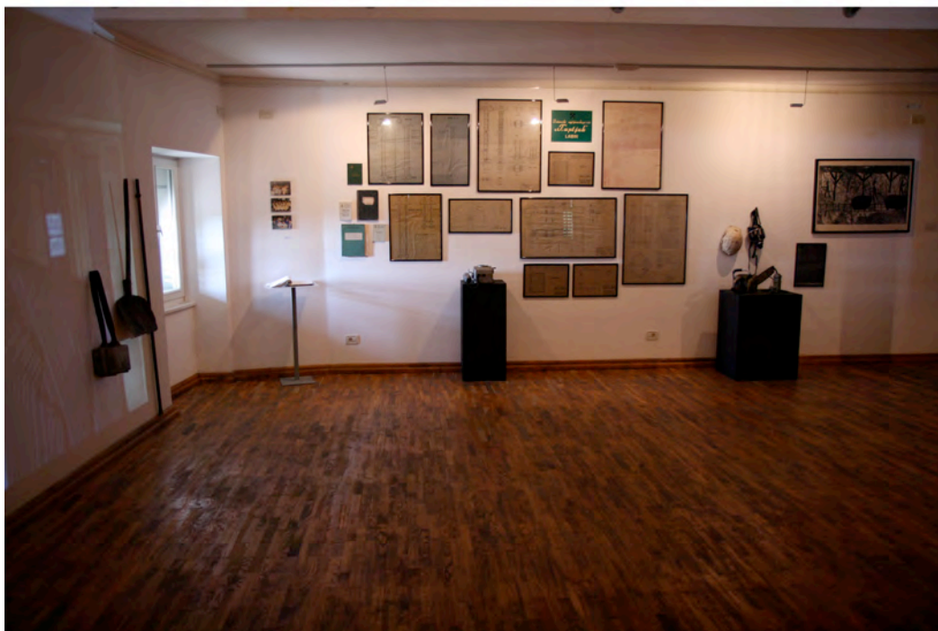
Miners' Memories, expanded documentary cinema, exhibition views, video: testimonies about the strike from 1987, 30 min., Labin Municipal Gallery, 2008.